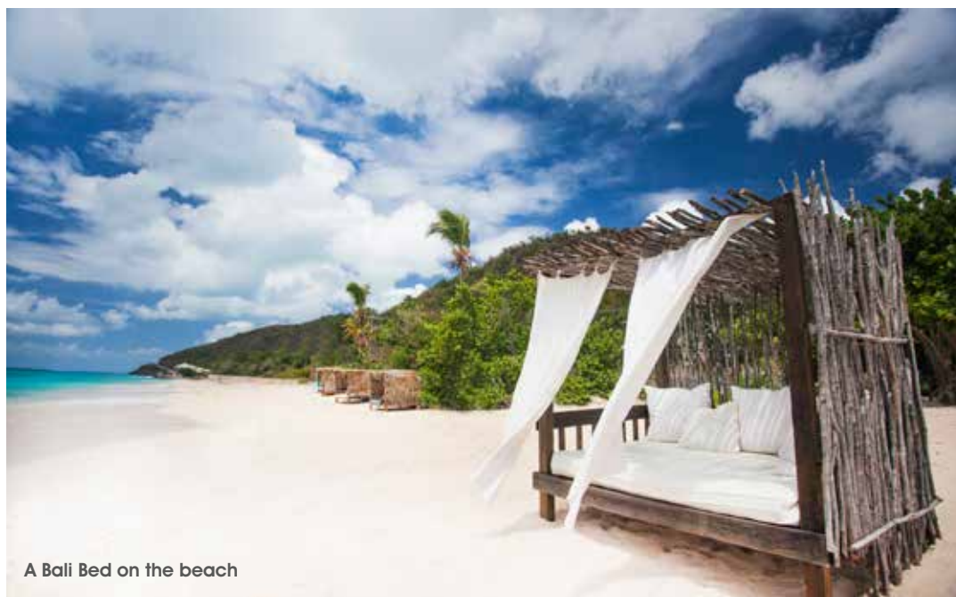
A Bali Bed on the beach

The cobalt ocean laps the bright, white, sandy shore and a yellow catamaran glides through the water as my mother Judy and I sit with welcome drinks in hand in the open lounge area of Keyonna Beach Resort on the south-western coast of Antigua. It's our first time to the Caribbean and we're ready to kick off our shoes and soak up some sun on one of the island's 365 beaches. The spiced rum in the Old Fashioned is firming this resolve.