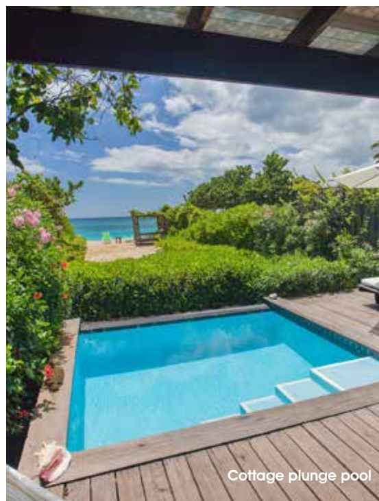
Cottage plunge pool