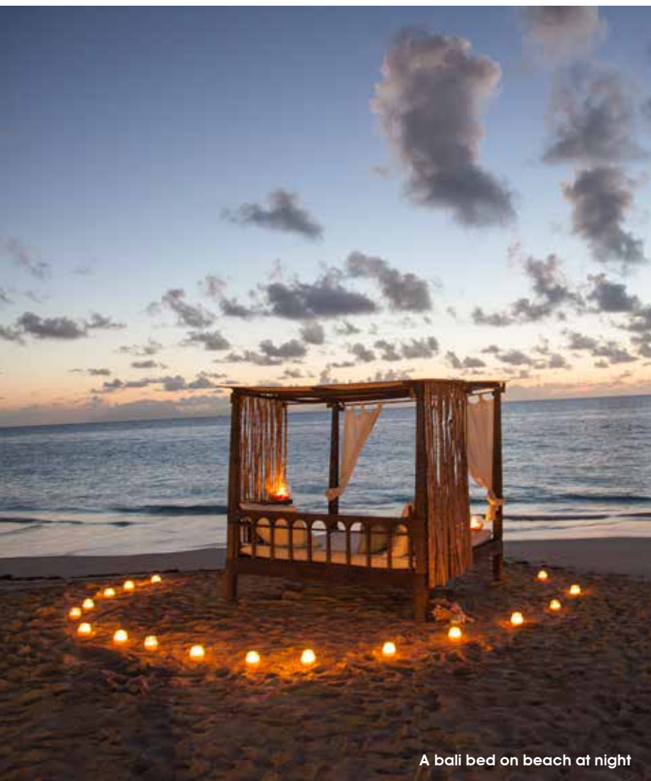
A bali bed on beach at night