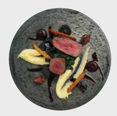
Kentish venison loin.