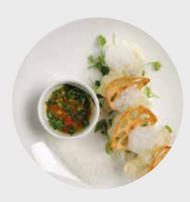
Tempura oysters with lotus root crisps.