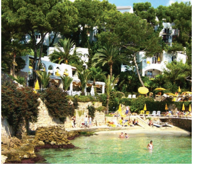
Above: Hotel BonSol stretches from the beach to the hilltop.

EVERY SUMMER, VISITORS FLOCK TO MALLORCA'S SHORES. GISELLE WHITEAKER DISCOVERS THAT THE WINTER SUN IN THIS SPANISH ISLAND DESTINATION ALSO HOLDS ALLURE.