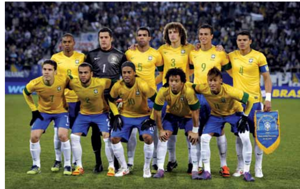
CLOCKWISE: Brazil's players, including Fernandinho (back row, far left) pose for a team picture prior to a friendly football match between Bosnia-Herzegovina and Brazil on 28 February, 2012 in St-Gallen; Fernandinho in action; Fernandinho vies with Cardiff City's South Korean midfielder Kim Bo-Kyung during a Premier League football match between Cardiff City and Manchester City on 25 August, 2013.

It's not surprising to learn that football runs in the family. "My father played football, so I