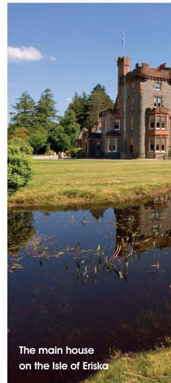
The main house on the Isle of Eriska

A selection of hors d'oeuvres appears in front of us and we nibble on the delights, which include a delightfully crunchy cauliflower crudité with Mull cheddar, cream and tarragon salt and smoked salmon on waffle, drizzled with heather honey and fennel yoghurt. It's the perfect introduction to a meal that we know is going to impress – the restaurant was awarded its first Michelin star last year. Our expectations are exceeded. The wedges of buttermilk loaf and stout-infused oat loaf are crusty accompaniments to the Celeriac soup with junipers that appears before us. The liquid has been aerated and is so light and fluffy that it is like eating a subtly flavoured cloud. Darryl is so impressed with this that he follows this up with Cullen