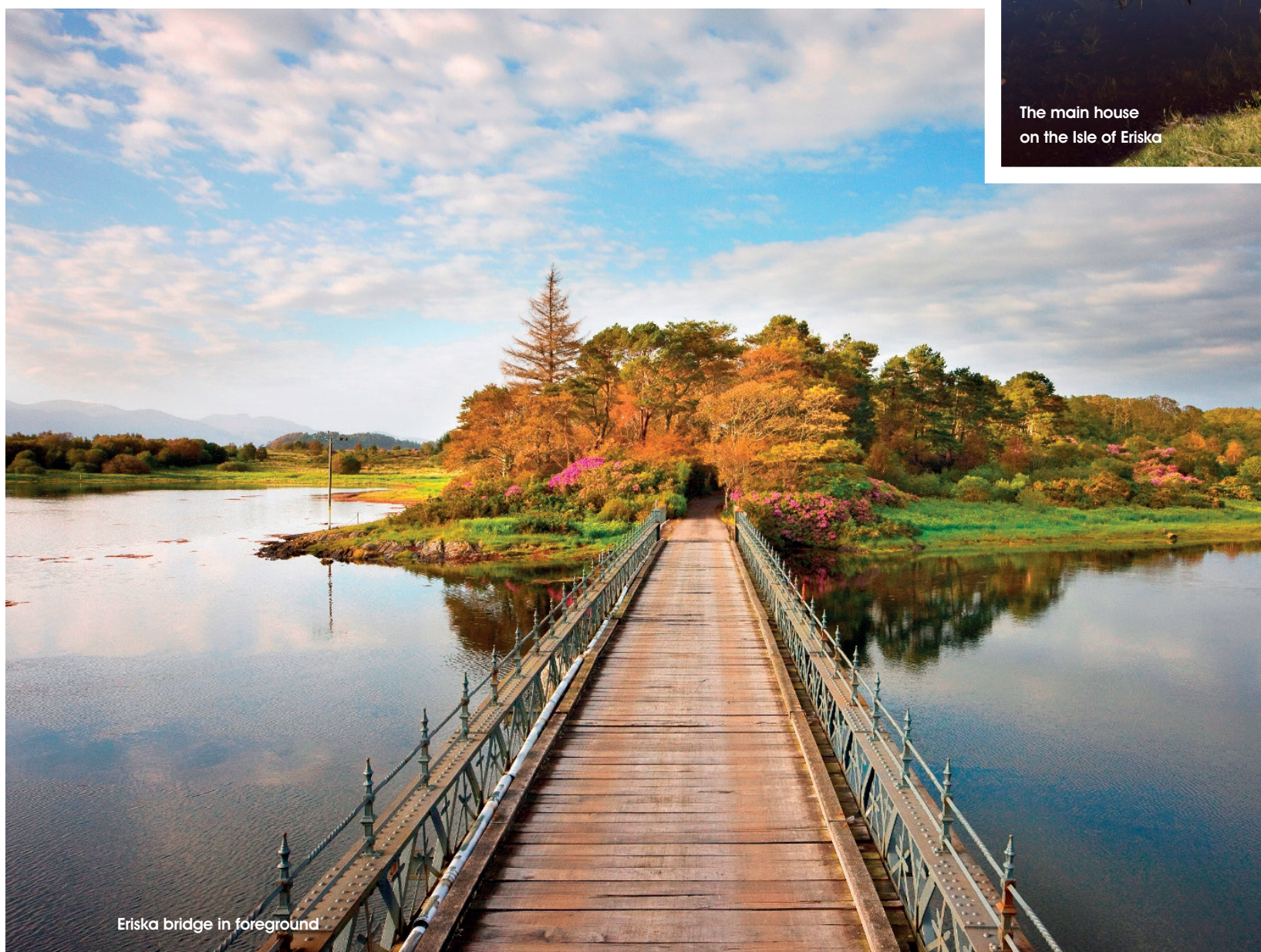
Eriska bridge in foreground